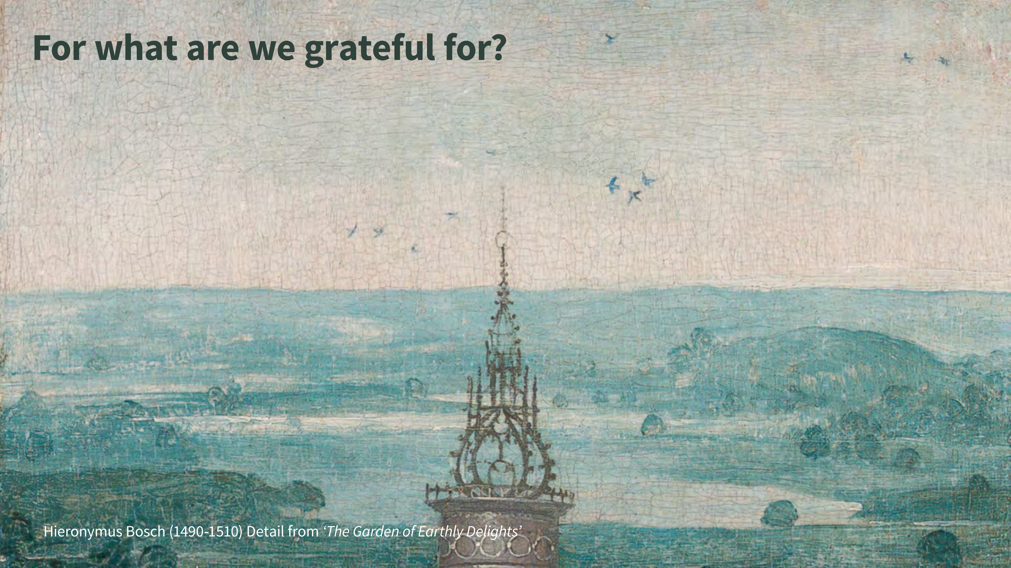
Hieronimus Bosch (1490-1510) Detail from 'The Garden of Earthly Delights'