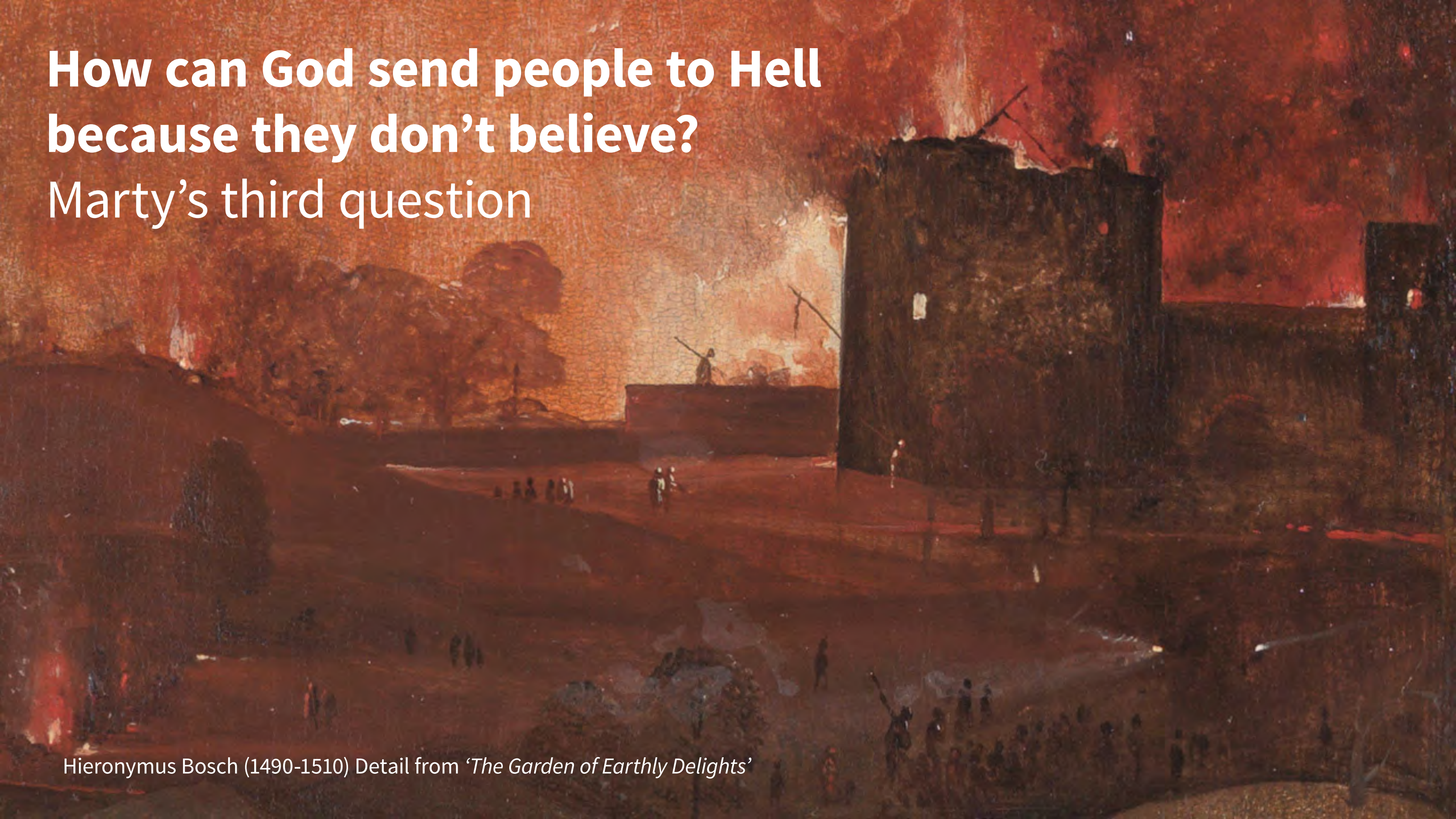
Hieronimus Bosch (1490-1510) Detail from 'The Garden of Earthly Delights'