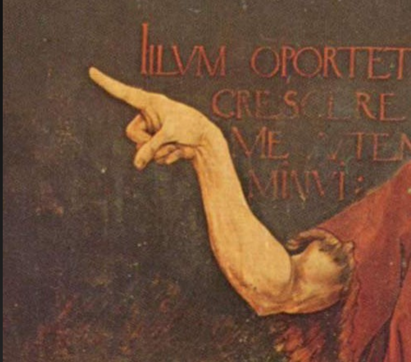
Note the very long index finger, pointing towards Jesus